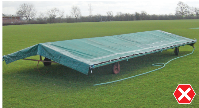
Climate Cover serves as a more practical and inexpensive solution to raised mobile pitch covers

Made from a unique material, the Climate Cover system provides an extremely lightweight and practical waterproof cover, enabling large areas to be covered easily and safely with minimum labour.